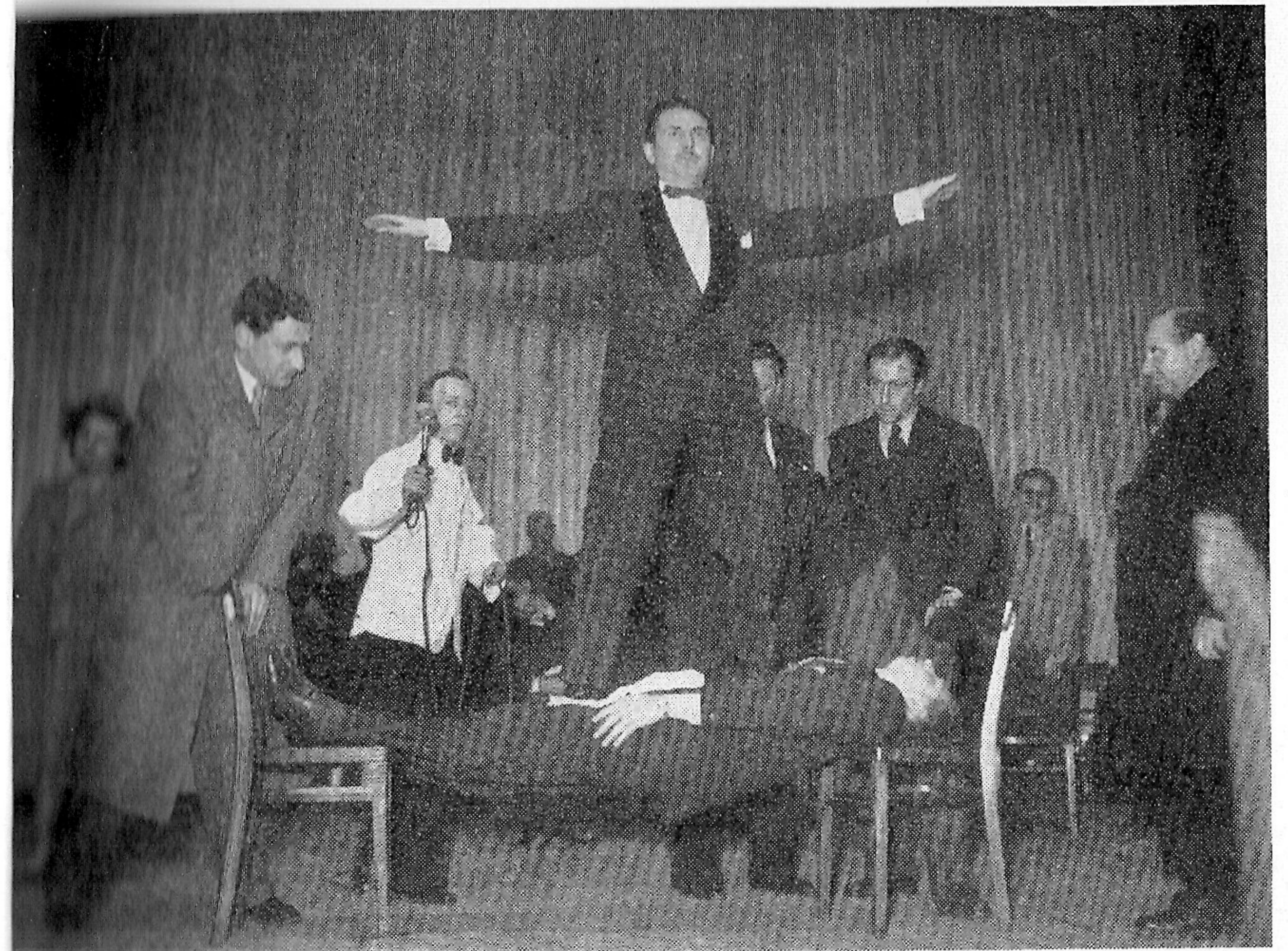
Planet News Ltd.

All these things were unrehearsed by-products of my ordinary stage show; for when at each performance I call for volunteers to come up on the stage, I have no way of telling what sort of people will come—and they are a mixed lot, believe me! Such “miracles”, then, have been witnessed by thousands—general public, medical men and newspapermen alike—and it is only natural that these many thousands will be wondering to themselves, in sickness and in health, how can hypnotism help ME? It is to try and satisfy this very natural curiosity that I have written this book.